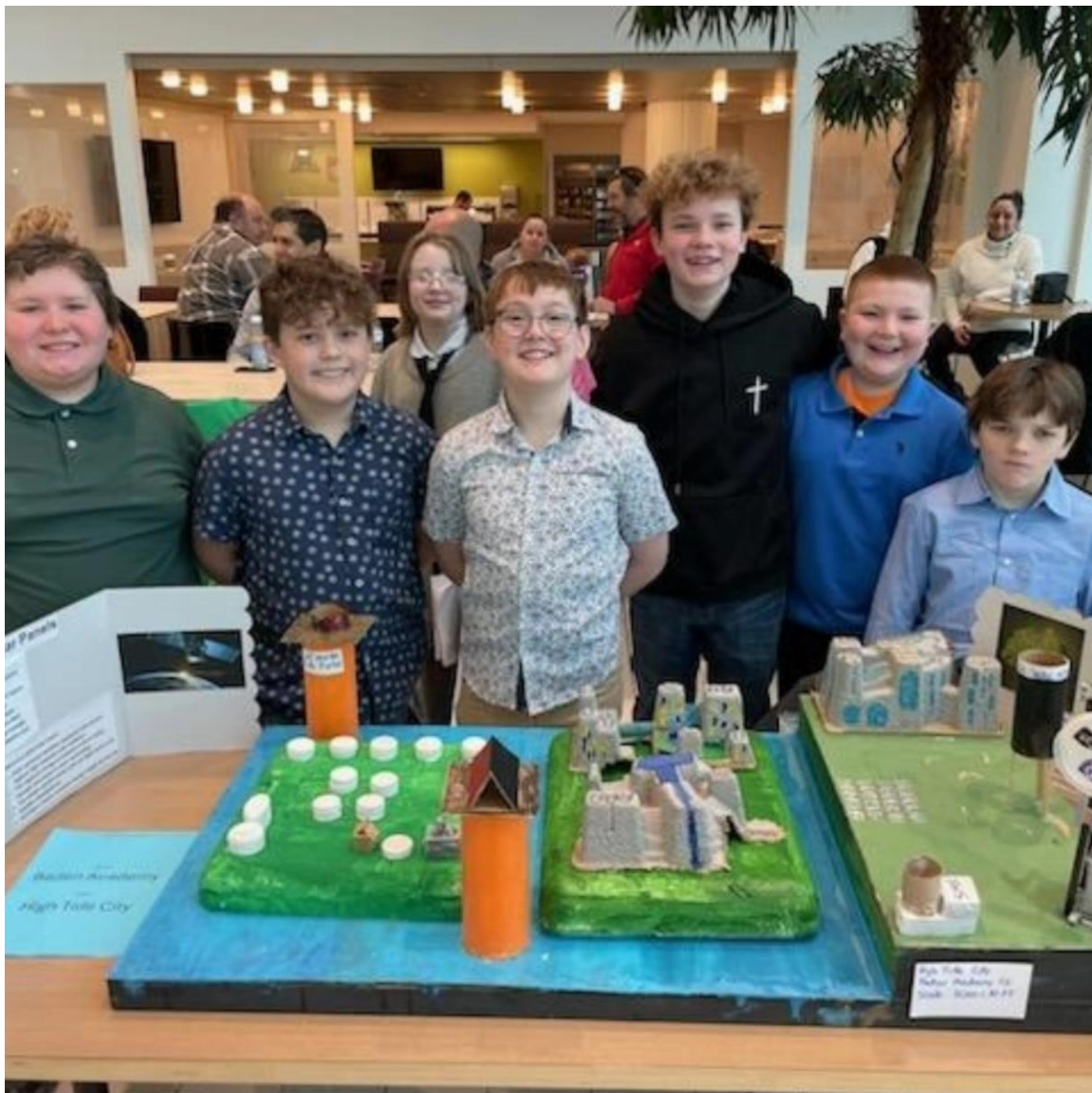
Future Cities Team